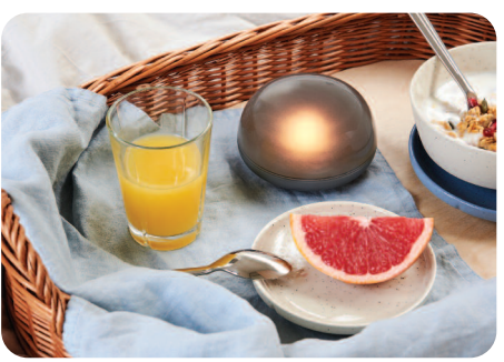
Danish Design Rosendahl Unveils Collections SEE PAGE 12