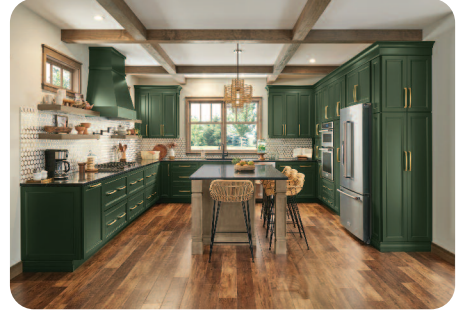
Earthy Boldness Kitchen Design Trends for 2024 SEE PAGE 5