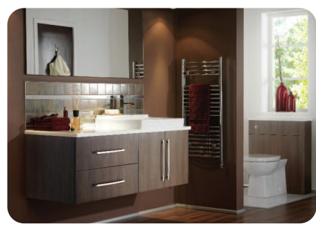
Design Goes Dark Homes Painted in Moody Hues SEE PAGE 7